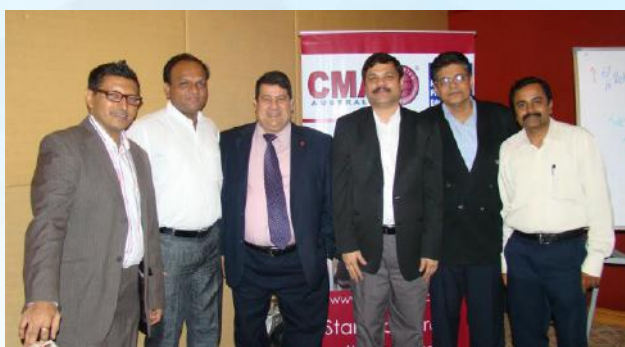
Participants of the 2 nd CMA program in Mumbai, January 2014.