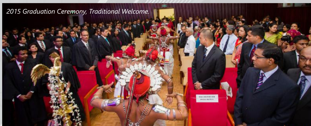
2015 Graduation Ceremony, Traditional Welcome.