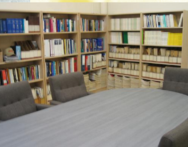
Executive Meeting Room.