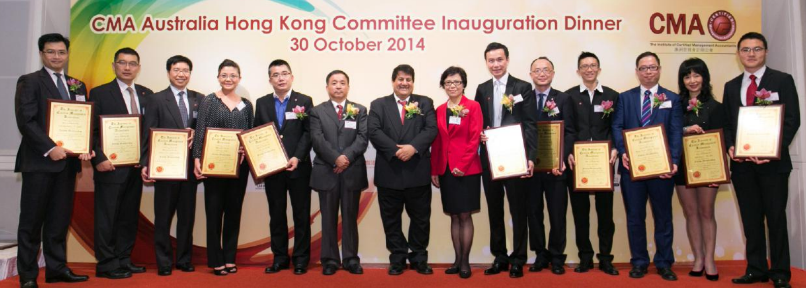
ICMA HK Fellowship Induction 2014

closely with Peking University ; the Stanford University Alumni Society and other professional bodies to arrange and design Continuing Professional Development (CPD) courses and events that are offered for its HK, China and Macau members and non-members; to enhance their knowledge and professional development.