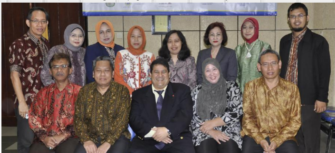
CMA Program Facilitators, Unair 2011.