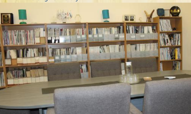
The Original Library