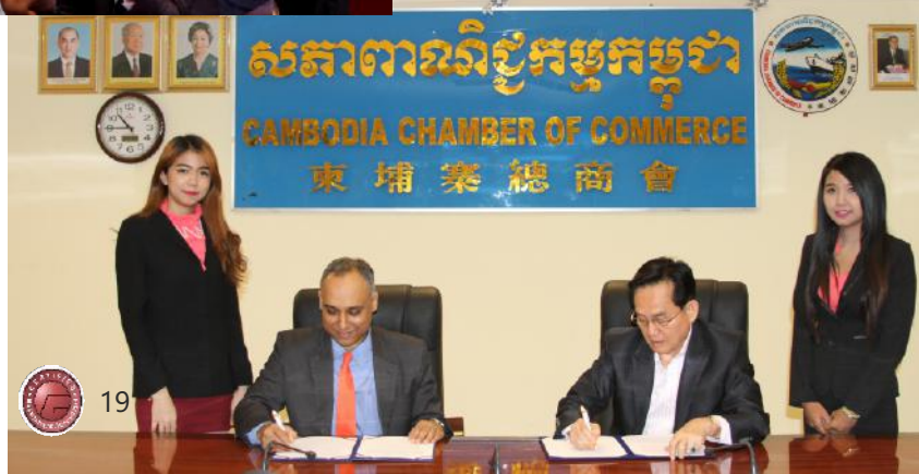
RHC signing an MOU with the Cambodian Chamber of Commerce