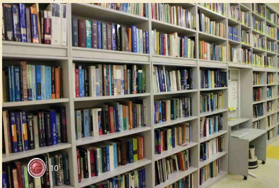
The Library after extensive extensions.

Up until 2006, ICMA did not consider 'Trade Marks' as an issue. Indeed, certain wordings cannot be trademarked, such as ' Certified Management Accountant ' and ' Certified Public Accountant ' as these are terms that describe generic