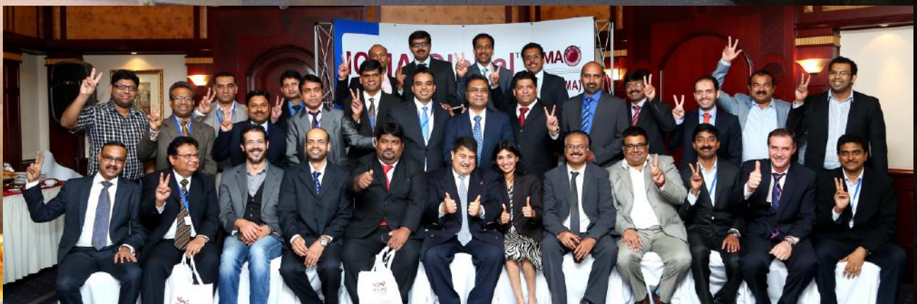
CMA Batch 15, November 2014