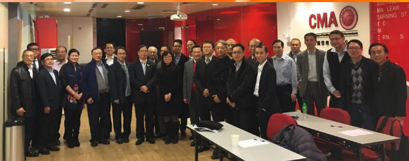
Executive Committee Meeting Participants

closely with Peking University ; the Stanford University Alumni Society and other professional bodies to arrange and design Continuing Professional Development (CPD) courses and events that are offered for its HK, China and Macau members and non-members; to enhance their knowledge and professional development.