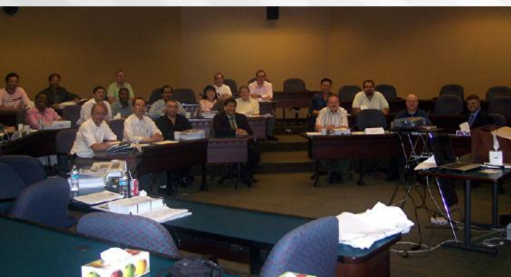
CMA Students at Ivey Business School's Wettlaufer Executive Centre.