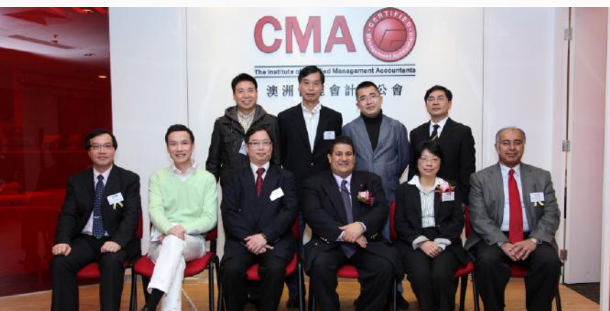
First Alumni Meeting