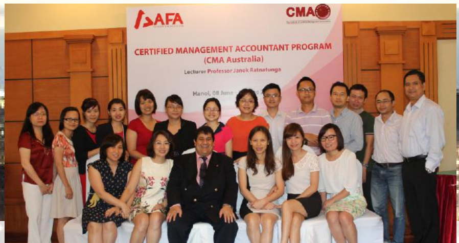
The first CMA Batch in Vietnam, June 2014.