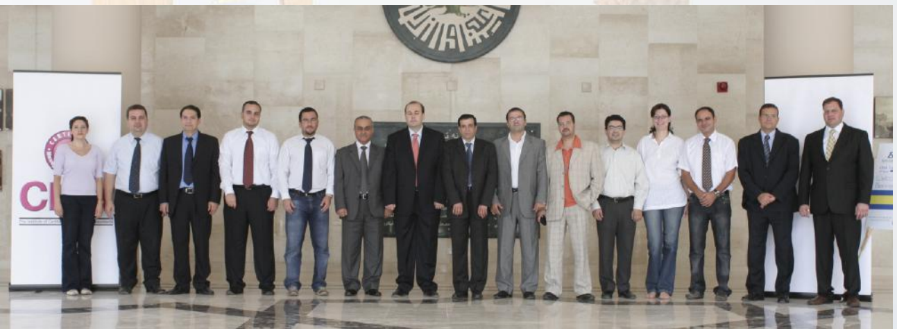
Tripoli, Class 3, 2007