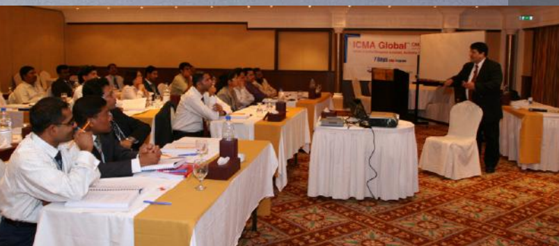
Prof Janek Ratnatunga conducting the first CMA intensive program in Dubai 2007.