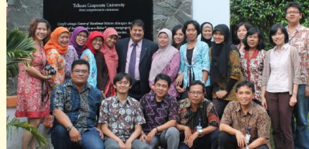
In-House CMA Program Participants at Telekom Indonesia, Bandung, 2013.