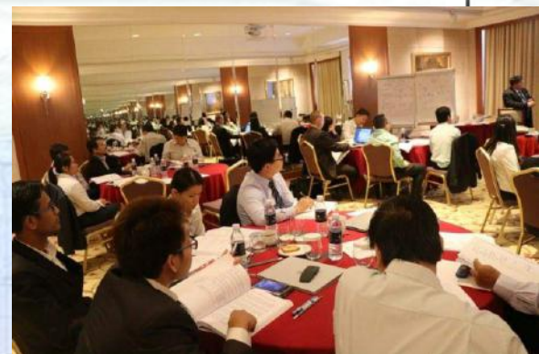
First CMA Workshop

As a young office in a developing country we intend to grow, and in the future, RHC hopes to facilitate ICMA as the foremost managerial accounting body in Cambodia through creating further partnerships throughout the community, facilitating continuing professional development for members, and implementing ICMA's international standard programs to an increasingly broad number of Cambodian students, always with an eye towards quality, social development, and ethics.