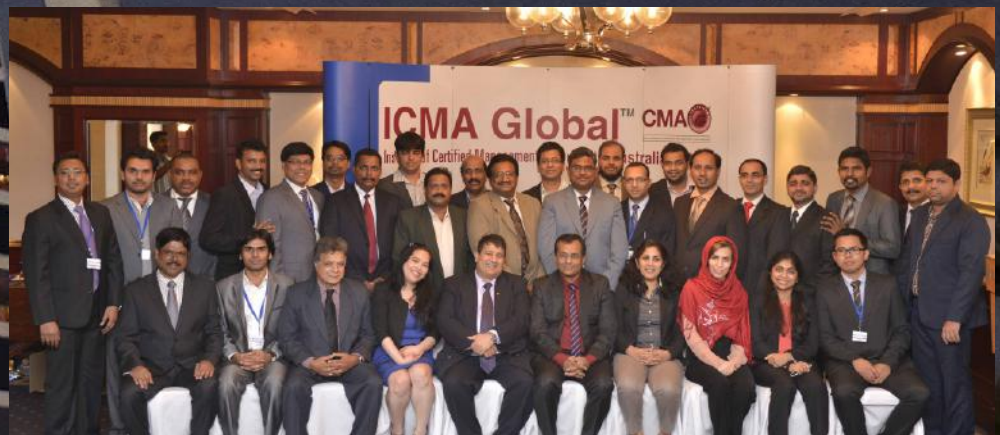
CMA Batch 13, November 2013