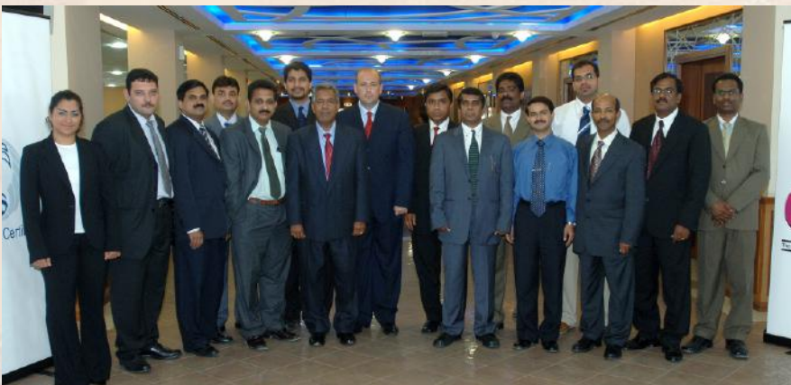
Beirut, Class 5, 2009