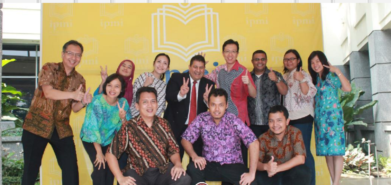
IPMI CMA Intensive Class May 2016