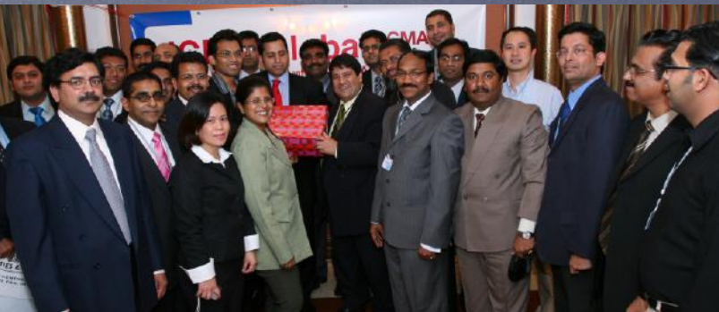
CMA Batch 1, 2007.