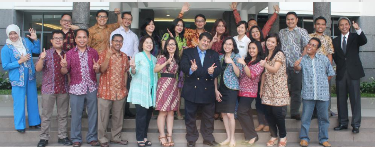
IPMI CMA Intensive Class May 2014