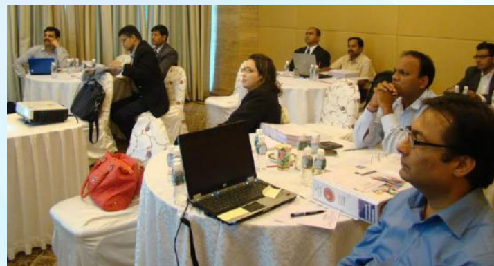
Participating in the first CMA program in Mumbai, July 2013.