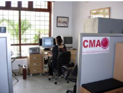
The ICMA Office in New Delhi