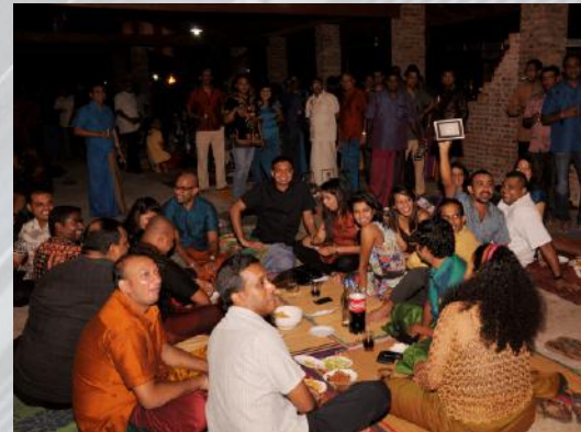
Members enjoying at the Annual Paduru (straw mat) party.