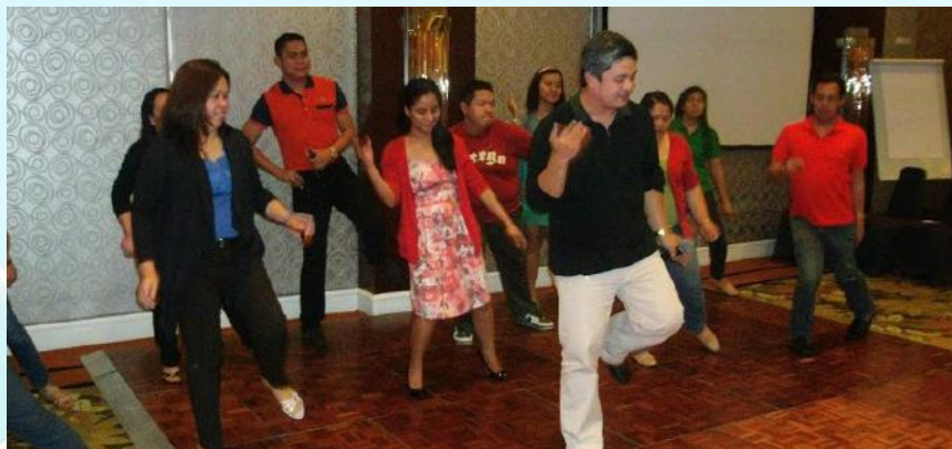
CMA Christmas Party 2015