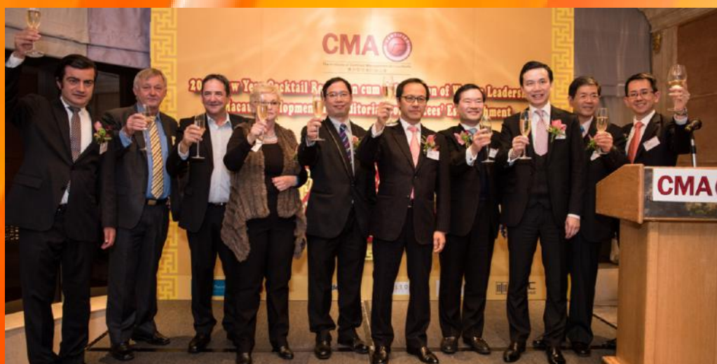
Celebrating the fifth anniversary of ICMA's Hong Kong Office.