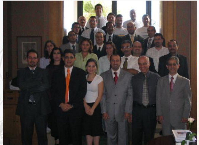
Beirut, Class 3, 2007