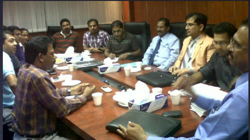
UAE Branch Steering Committee Meeting