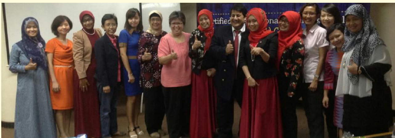
CMAs who undertook the 'Certified International Business Analyst (CIBA)' program provided as CPD by the Academy of Finance and Management Australia (AFMA) in 2014.