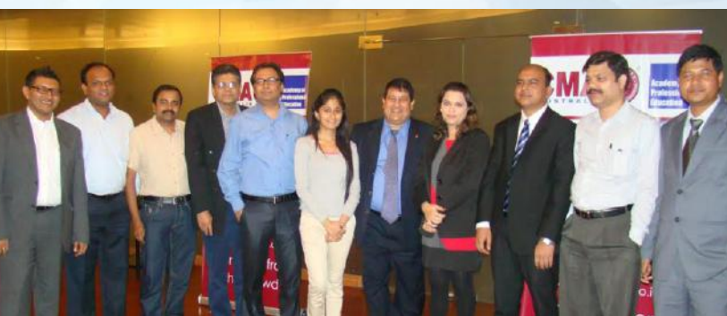
First CMA Gathering in Mumbai, July 2013.