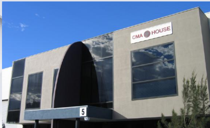
New Headquarters at CMA House at the Monash Corporate Centre in Clayton Victoria.