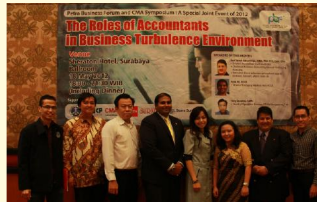
'Role of Accountants in Turbulent Business Environments Conference', May 2012 organised by Petra University, Surabaya.