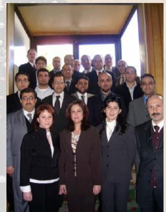
Beirut, Class 4, 2008