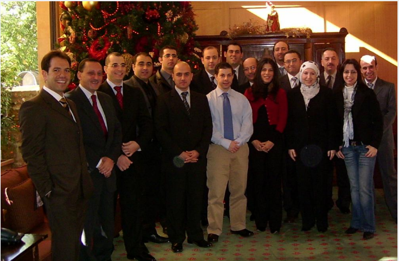
Beirut, Class 2, 2006