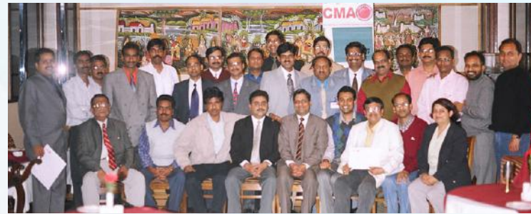
Participants at an early CMA program in New Delhi.

program fee in India. These individuals could pay for air tickets and a holiday back home, as well as pay the program fee; for less than they could do the program in Dubai itself. Due to concerns of cannibalisation by the Dubai Provider; ICMA wound down the India program in 2008.