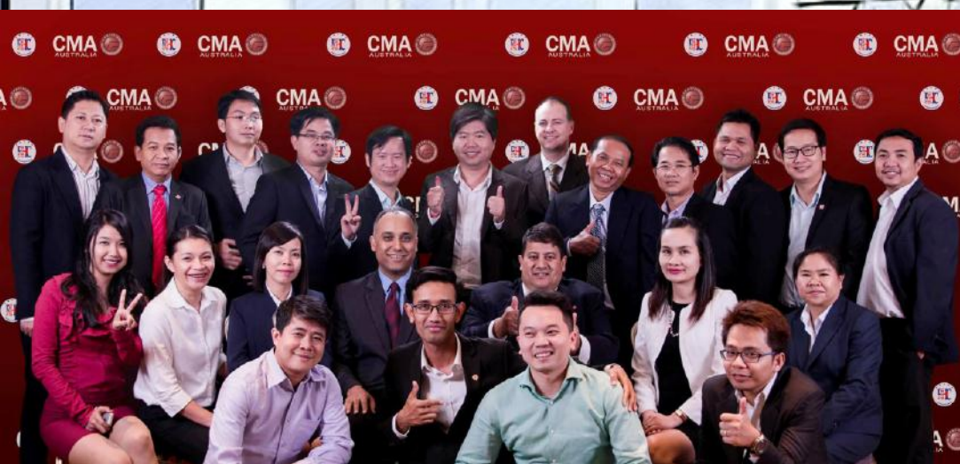
Participants in the First CMA Batch