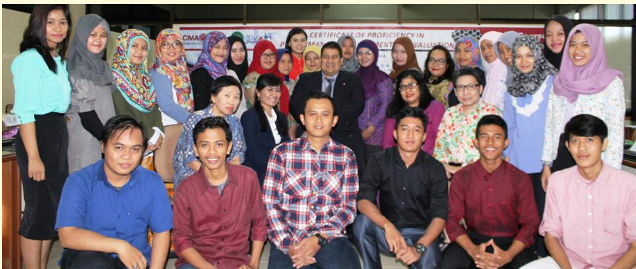
Participants in the 'Certificate of Proficiency in Performance and Valuation' program in Surabaya May 2016.