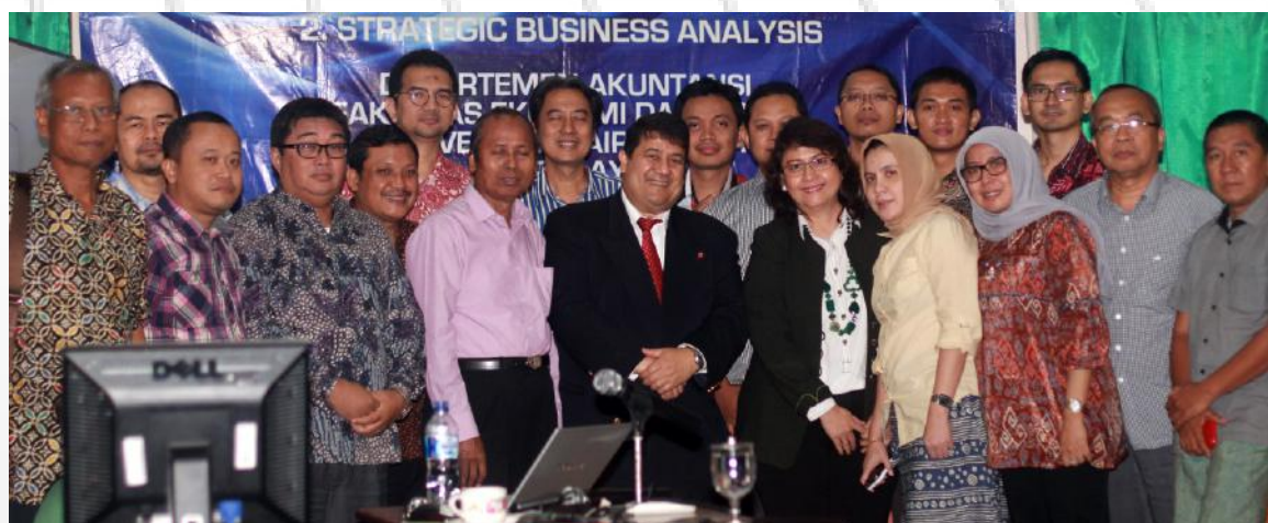
CMA Class at Unair, December 2014