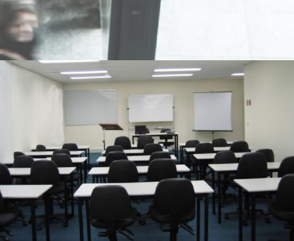
Training Room at CMA House.